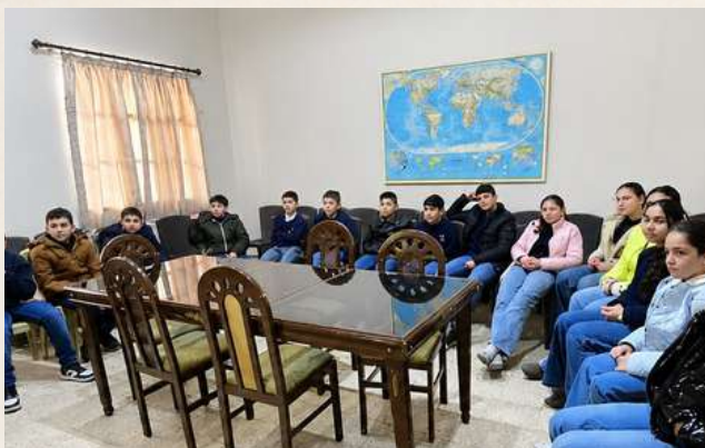
syrian children watch the presentation of Italy sent by Italian students

Mosaics, soap, perfumes are typical products of Syrian culture. Many different ethnic groups (Arabs, Armenians, Kurds, Turks) live in Aleppo. The main religion is islam, but Christianity is also present, especially in Aleppo.