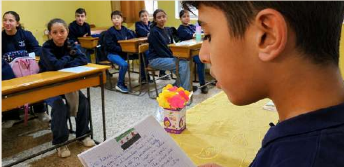
syrian children read the letters sent by Italian students

Dear matilda, it was really nice to read your letter... i don't like series, but I like watching anime and drawing my favorite anime character mitsuri kanroji.... how are you: kifak Hallo in arabic: marhaba, Gold morning in arabic: sabah alkhayr